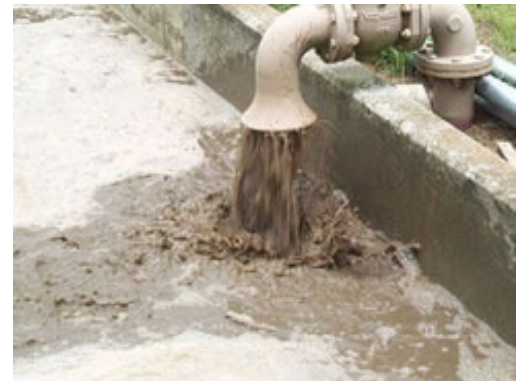
Wasting at an Activated Sludge Facility

The long-term Wastewater Treatment class is based on the Wastewater Treatment Operations textbooks from California State University. The class is not only for wastewater treatment facility operators, but also for collections personnel, city superintendents, public works directors, and any other personnel who work with wastewater treatment plants. The 16-18-week course is taught in the classroom one afternoon a week usually from 1:00 pm - 5:00 pm.