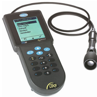
During PIT Stops students learn how to use equipment, such as this Dissolved Oxygen meter.

One of the features of WWWATER training is the PIT Stop (formerly called JSIs), These are usually day-long opportunities, and are great for the student who wants to go “above and beyond” normal classroom activities. PIT Stops give the student the possibility for customized, individual learning experiences that are as varied as each student makes them. They give the student actual hands-on experience while under the guidance and instruction of the teacher. They are a great way for